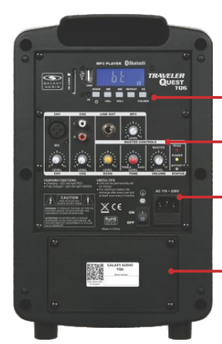
TQ6 - BACK VIEW

Weight: 9.35 lbs (4.24 kg) (battery included)